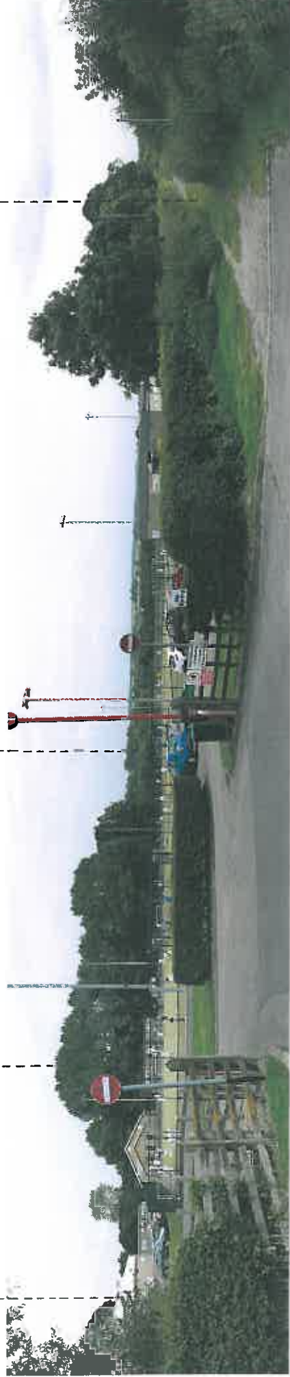
View 5 - Prince William School, Herne Road