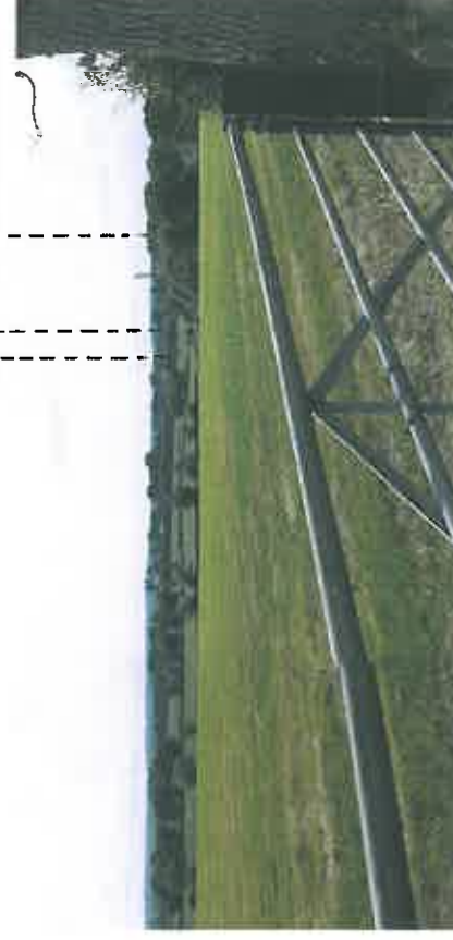
View 6 - Neris Way at Olive Grove Nursery