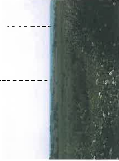
View 8 - Main Street, west of Tansor Wold Farm