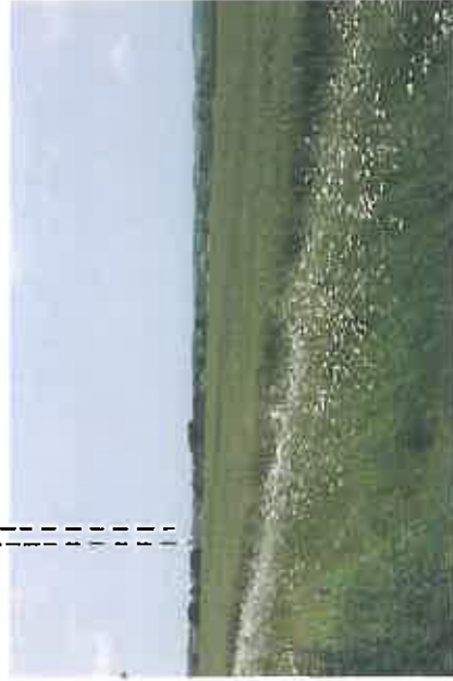
View 7 - Stoke Doyle Road, south of Stoke Doyle