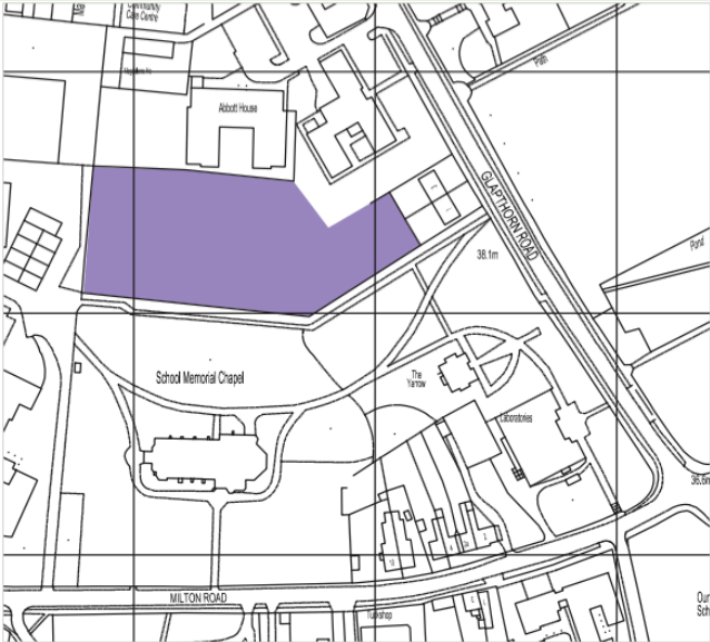
Fletton Field, Oundle Primary School, Glapthorn Rd